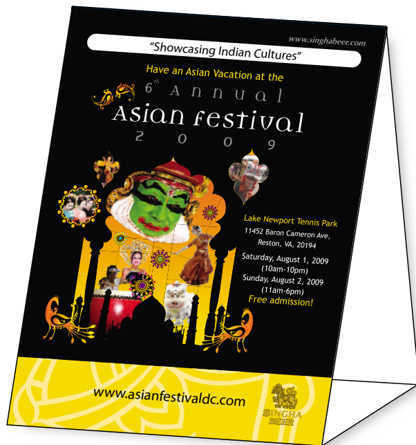
Table Tent Templates

Have a question or want us to do it for you? Give us a call. 1.800.930.6040